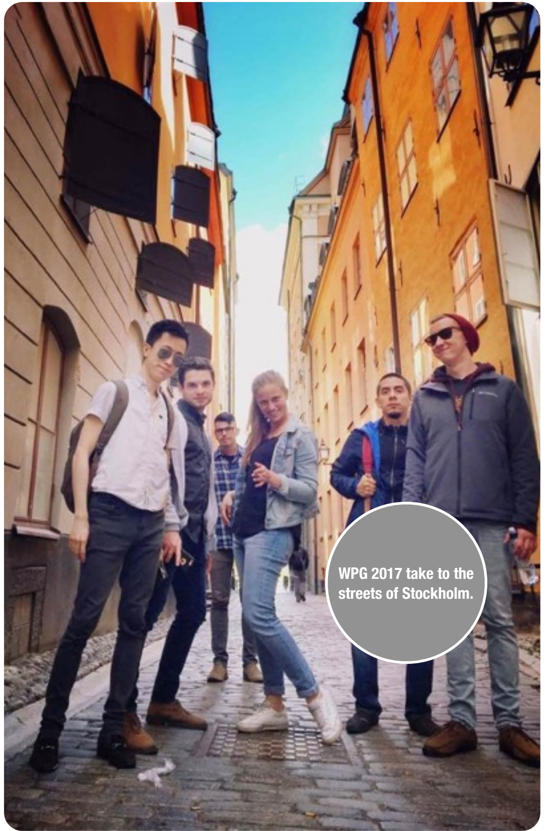
WPG 2017 take to the streets of Stockholm.